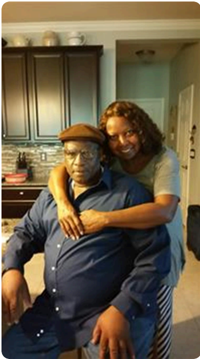
So In Love